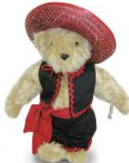
The Liberty Bears' Cinco de Mayo Social: SUNDAY, May 3, 6pm-10pm, Bike Stop.