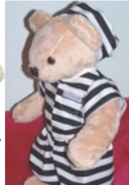
The Liberty Bears' "Lock Up" Social, Sat., Mar. 7, 6pm-10pm, Bike Stop.