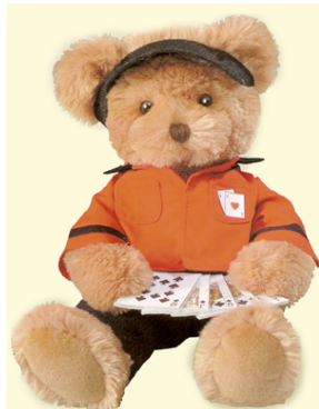
The Liberty Bears' 6th Annual Beargata: Sat., Mar. 7, 6pm-10pm, Top of the Bike Stop.

So for an evening of gaming, cheap beer, and hot bears, join us at The Liberty Bears' 6th Annual Beargata, Sat., Mar. 7, 6pm-10pm, at the Bike Stop.